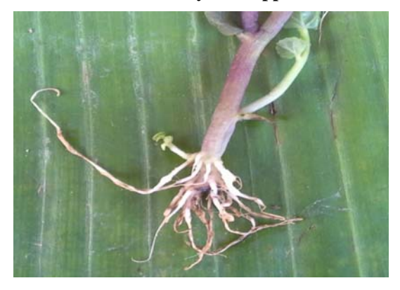
Galls on Sida accuta