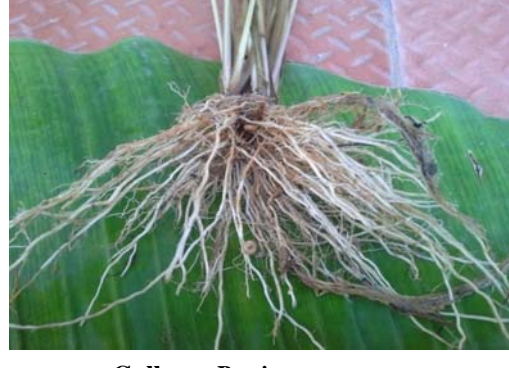
Galls on Panicum repense