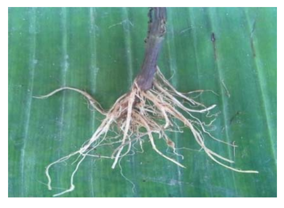
Galls on Hydrilla spp.