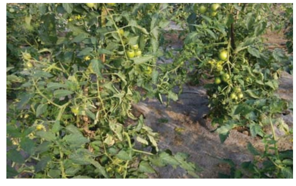
Fig. 3:Three months aged tomato crop with fruits.

The above treatments were replicated four times in randomise block design with growing Tomato, (var. -Pusa Ruby) as test crop. The field experiment was carried out during November to February, 2014-15 and 2015-16. The area of each plots were maintained by 36 sq.m with spacing of 75 cm between row to row and 75 cm between plants to plants. Each year tomato crop was harvested during February. All jute agro textiles (of different strength) laid on soil before seedling transfer into main field. Soil sample were collected from 0-15 cm depth and moisture content at 7 days interval from entire growth period were determined by gravimetric method by Black (1965). Bulk density, porosity and size distribution of aggregates in soil was evaluated by the methods as proposed by Piper (1966). The pH, organic carbon, availabilities of phosphorous and potassium were determined by the standard procedure of Jackson (1965). Cost benefit ratios was calculated by the ratio of total economic return (Rs) and total cost (Rs). Moisture use