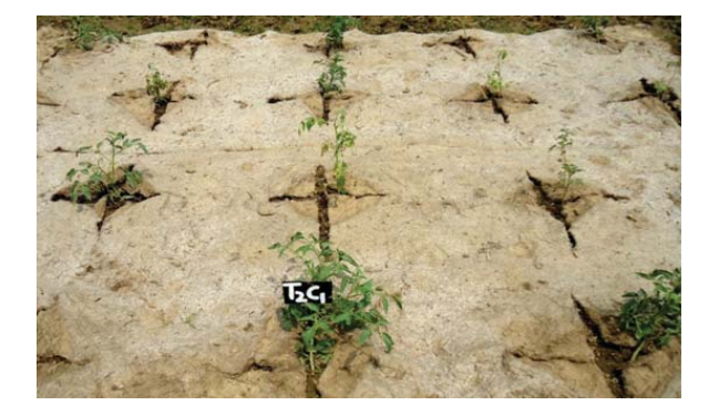
Fig. 2: Photograph. 1.15 days aged tomato crop with jute agro textiles.

20 :40 :40 (kg ha<sup>-1</sup>), T_4 : Jute agro textiles (200gsm) + NPK @ 20 :40 :40 (kg ha<sup>-1</sup>), T_5 : Control (farmer practice) + NPK @ 20:40:40 (kg ha<sup>-1</sup>), (gsm= gram per square meter).