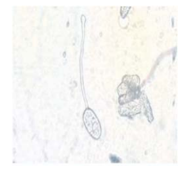
C. Initial stage of an appresorium formation D. Formation of an appresorium Fig. 3: (A-D). Germ tube and appresorium production of conidia of Podosphaera pannosa under in vitro condition

Double strength solution of each culture filtrate was prepared in the sterilized distilled water. Simultaneously, the spore suspension of powdery mildew fungus (28-30 per microscopic field) was also prepared by dislodging the conidia from the infected leaves. One drop of each (i.e. culture filtrate and spore suspension) was separately put in the cavity of cavity slide, cavity slides containing mix were later placed on a glass rod, kept in a Petri plate containing sterilized distilled water at the bottom and sterilized moistened cotton wool lining the inner surface of the upper lid. Petri plates were then kept in the growth chamber for incubation at 25+1°C with 85 per cent relative humidity. The experiment was laid out in a Completely Randomized Design (CRD) and each treatment was replicated three times. The readings on germination of conidia were recorded after 24, 36, 48, 60 and 72 hrs by placing cavity slides under light microscope and per cent inhibition in germination of each culture filtrate was calculated by adopting the formula as given by Vincent (1947).