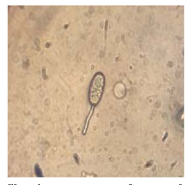
A. Showing emergence of germ tube