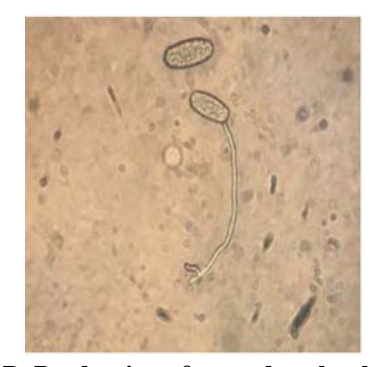
B. Production of secondary hyphae