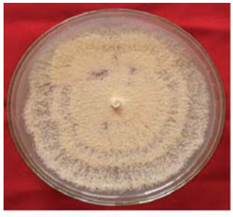
H. Trichoderma sp

Fig. 1: (A-H). Fungal microflora isolated from rose phylloplane