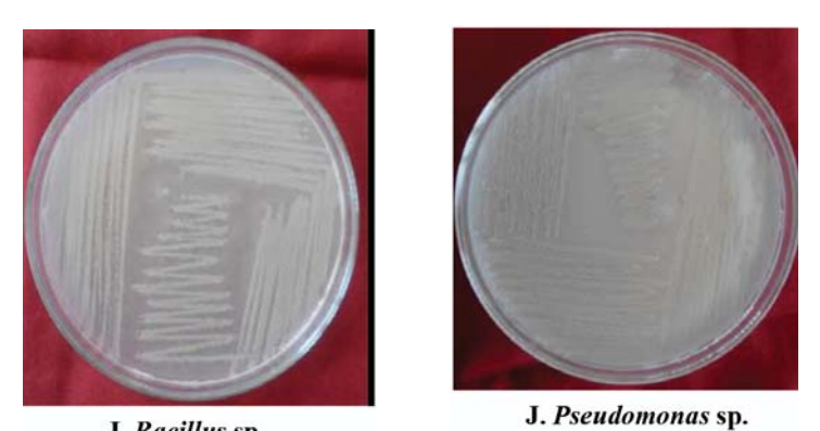
I. Bacillus sp. J. Pseudomonas sp. Fig. 2: (I-J). Fungal microflora isolated from rose phylloplane

Fig. 1: (A-H). Fungal microflora isolated from rose phylloplane