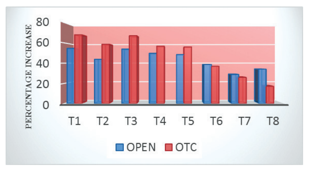
Fig. 3 : Impact of elevated CO<sub>2</sub>on number of flowers per cluster per plant