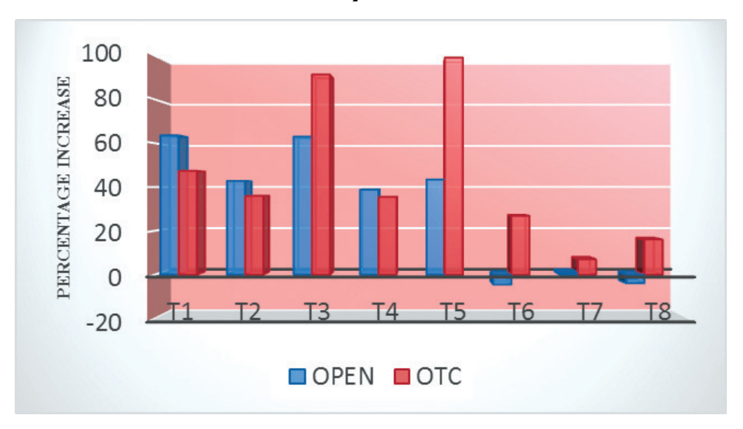
Fig. 2 : Impact of elevated CO<sub>2</sub> on number of flower clusters per plant