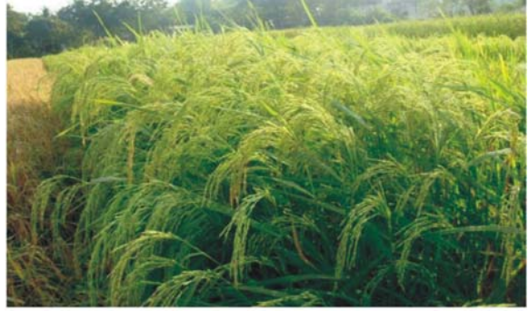
Fig. 1. A field view of Bidhan Moti 2

Photoperiod insensitivity and heading time (flowering time) which are mainly accountable for the crop growth duration are the principle characters that determine the regional and seasonal adaptation of crop varieties (Sato et al., 1988). A large number of loci (23) are involved for controlling the heading time in rice (Nishida et al., 2001) and seven quantitative trait loci have been reported for the same also (Yano et al., 1997; Yamamoto et al., 2000). Due to recombination and different kinds of interactions among the heading time genes, photoperiod sensitivity gene (Se5) and earliness genes, the RILs become early and photoperiod insensitive. Disruptive seasonal selection has made RILs equally adapted to kharif as well as boro seasons. Aromatic rice varieties differ in their degree of aroma and are broadly classified as strongly, moderately and weakly scented types (Singh et al., 2003). Indian consumers value aroma most (Singh and Singh, 1997) and it fetches premium in middle-East (Shobharani and Singh, 2003). Physical properties like grain shape and size mainly determine market acceptability